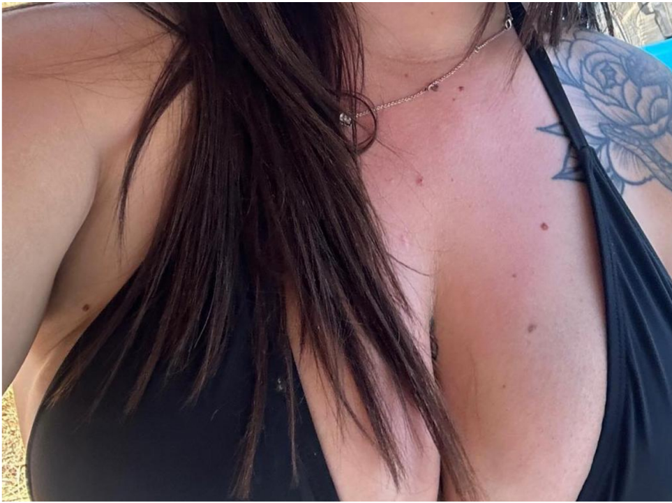
She has been remanded in custody.

Ammunition for various high-powered firearms was also allegedly found inside a fish food container on a coffee table inside the home.