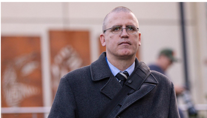
Police & Courts

Detective grilled about why police didn’t seize more devices, records after lethal lunch